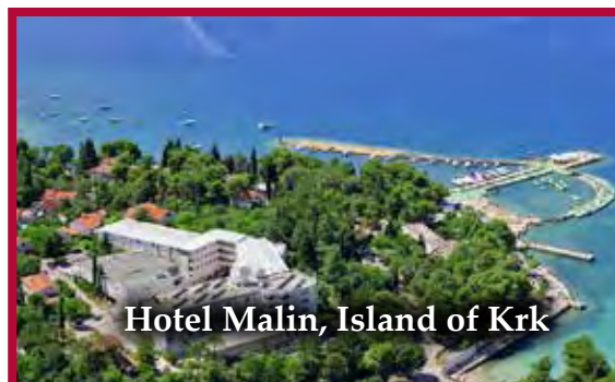
Hotel Malin, Island of Krk