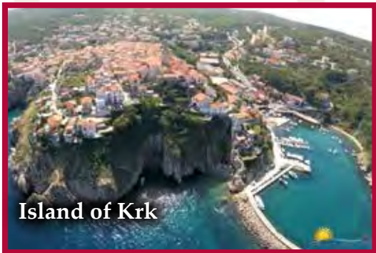
Island of Krk